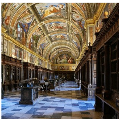
Library of the Monastery of El Escorial

Real Biblioteca del Monasterio de San Lorenzo de El Escorial (Library of the Monastery of El