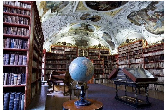
Strahov Theological Hall - Original Baroque Cabinets, Prague

The Strahov Library is located in Prague, Czech Republic, within the Strahov Abbey buildings complex. The history of the Strahov Abbey dates back to 1140. Through time, the library took many forms. In the 17 th century, the Baroque Theological Hall, the oldest part of the library, was completed, and the Classicist Philosophical Hall was completed in the 18 th century. The 200,000 items in this collection cover a huge diversity in subjects including religious, juridical, medical, and astronomical. There are medieval manuscripts and even a cabinet of curiosities. Explore the 3D tour of this jaw-dropping library.