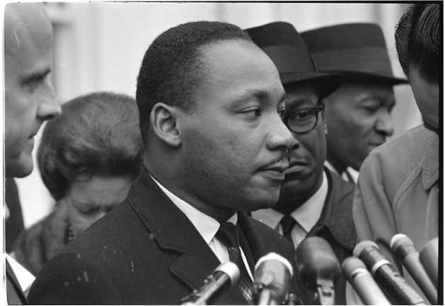
Image, [Martin Luther King, Jr., head-and-shoulders portrait, facing right, at microphones, after? meeting with President Johnson to discuss civil rights, at the White House, 1963]

The first Congressperson to propose a bill for a national holiday honoring Dr. King was John Conyers in 1968, four days after King's assassination. Representative Conyers reintroduced this legislation every year from then on. After the creation of The Martin Luther King, Jr. Memorial Center on June 26, 1968, informal observances of Martin Luther King, Jr. Day started on January 15, 1969 , as January 15 was Dr. King's birthday. By 1971, three million signatures had been gathered and presented to Congress to petition for a holiday in honor of Dr. Martin Luther King, Jr. In 1978, the National Council of Churches joined this call for a holiday. In 1979, Coretta Scott King, Dr. King's widow, testified in front of the Senate Judiciary Committee and in front of Joint Hearings of Congress. With the support of President Jimmy Carter and a petition signed by at least 300,000 Americans, the King Holiday bill was brought to the floor of the House of Representatives. This bill ended up five votes short of a two-thirds majority with a 252-133 vote count. Between 1980 and 1982, Coretta Scott King continued to lobby the public and state legislatures for recognition of a holiday. In February 1982, Ms. King again testified before a Congressional Committee for recognition of the holiday.