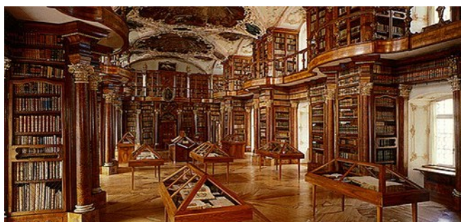
Abbey Library inside the Abbey of St. Gall

Abbey Library inside the Abbey of St. Gall , St. Gallen, Switzerland, has a history that dates back to the Middle Ages, a hermit community, and Gall, an Irish missionary. It was not until 1553, however, that a building was constructed to house the library. The building was replaced in 1767. This collection of early European history includes Medieval manuscripts dating as far back as the 8 th century, many of which are available for researchers. The library still actively collects items, including modern journals.